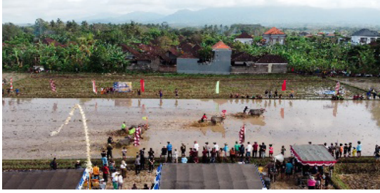
Figure 14. Sequence Six visually

The primary motivation of this sequence is to highlight the contrast between the grandeur of the all-in-one circuit and the condition of the traditional circuits in the rice field area threatened by land conversion. Through the visual selection of circuits in the threatened rice field area and interviews about the legal status of the Mekepong circuit, this sequence aims to emphasize the urgency and importance of preserving the traditional circuits as part of the agrarian ecosystem and cultural heritage in Jembrana.