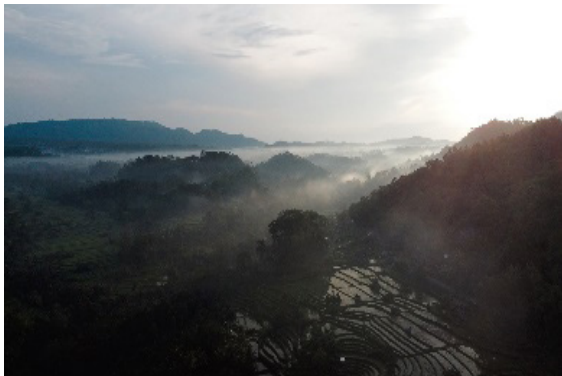
Figure 9. Sequence One visually

Motivation: The motivation behind Sequence One is to dramatically showcase the natural beauty of Bali and captivate the audience's attention. By featuring landscapes such as beaches, mountains, rice fields, and other natural elements, the sequence aims to depict the island's natural splendor. Traditional dances and religious rituals are utilized to enrich the audience's visual experience and highlight Bali's cultural richness.