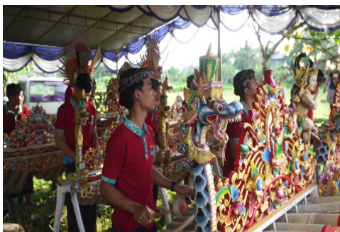
Figure 2. The Accompanying Music

This can be proven true, and the creator can witness it during the documentary filmmaking process. The creator made an effort to capture all the elements present during the Mekepong Lampid event, including the ambiance at the circuit or venue, the attending community, Mekepong jockeys, accompanying music, buffaloes, and the utilized attributes, as well as the entire procession from the beginning to the end.