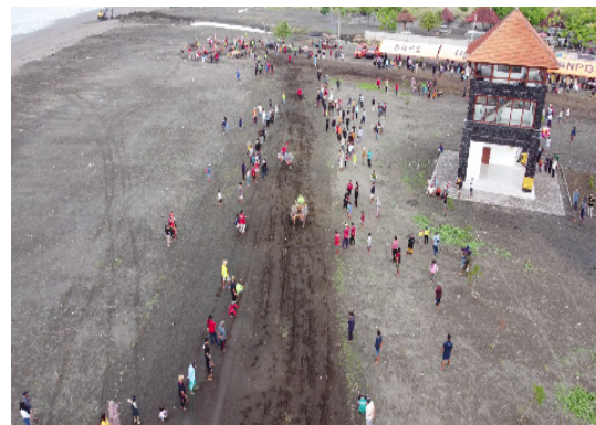
Figure 7. Mekepong Cekar Circuit