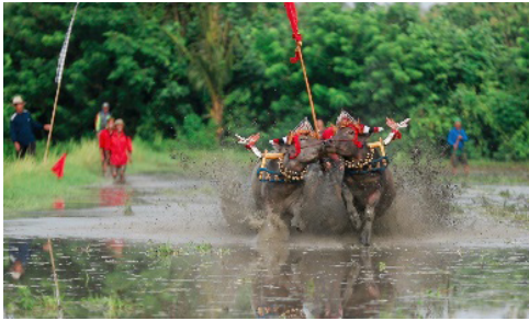
Figure 15. Sequence Seven visually

The motivation behind this sequence is to highlight the importance of maintaining a balance between the Mekepong tradition and tourism development in Jembrana. Its goal is to demonstrate that these two sectors can coexist without conflict while emphasizing the cultural values and local wisdom embedded in the Mekepong tradition. Sequence seven depicts the balance that should be maintained between the Mekepong tradition naturally and the development of tourism in Jembrana without blaming either sector, so they can coexist harmoniously.