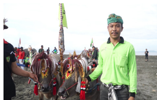
Figure 8. Mekepong Jockeys

Image 7 depicts the location where the Mekepong Cekar tradition takes place, highlighting the contrast with Mekepong