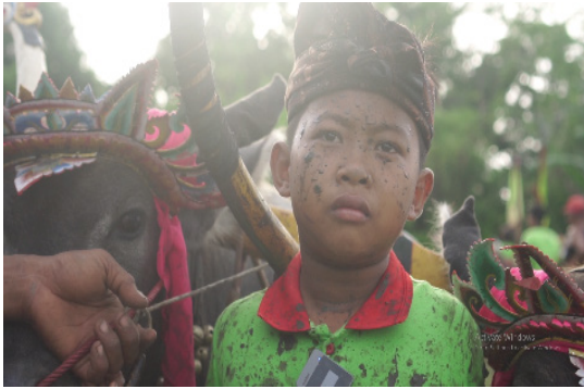
Figure 4. Child Jockeys