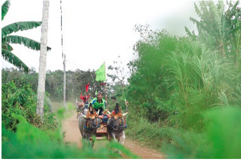
Figure 16. Sequence Eight visually

The primary motivation behind the visuals in sequence eight, serving as the conclusion, is to highlight the strong involvement of the younger generation in the Mekepong tradition as a symbol of cultural sustainability in Bali. The participation of children, teenagers, and young adults as jockeys underscores the importance of the younger generation in preserving cultural traditions.