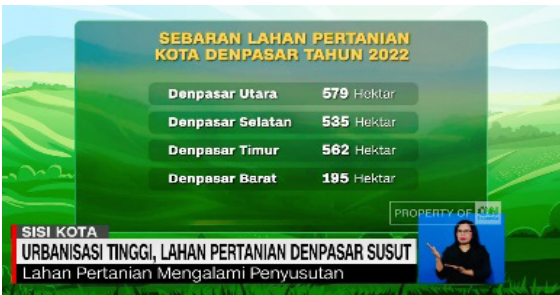
Figure 10. Sequence Two visually

Motivation: The motivation behind sequence Two is to highlight the contrast between the prosperity generated by the tourism sector and the challenges faced by the agricultural sector in Bali. Visualizing the economic benefits of the tourism sector alongside the issues encountered by agriculture aims to convey the significant disparity between these two sectors in providing welfare for the Balinese community.