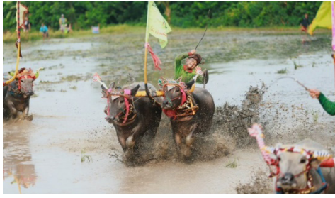
Figure 1 . Mekepong Lampit

As Hebding and Glick (1992), as cited by Sudiarta (2011:12), elucidate, culture can be observed in both material and non-material forms. Material culture manifests in tangible objects produced and utilized by humans. For instance, from the simplest tools to more intricate items such as hand jewelry, necklaces, household utensils, and clothing. Conversely, non-material culture encompasses elements such as norms, values, beliefs, and language.