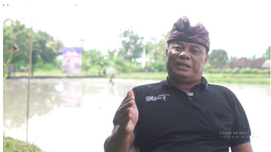
Figure 5. Mekepong Coordinator