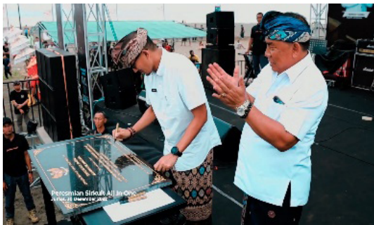
Figure 13. Sequence Five visually

The primary motivation of this sequence is to highlight the peak of the Mekepong tradition as a significant tourist attraction in Jembrana Regency. Emphasis on key moments, such as the inauguration of the all-in-one Mekepong circuit by the Minister of Tourism and Creative Economy of Indonesia, aims to draw the audience's attention and demonstrate full support from the government and local community for this tradition.