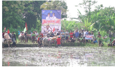
Figure 3. Enthusiasm of the community

In Image 2, it presents the documentation result of Jegog traditional music, which is a distinctive musical feature of Jembrana regency, showcased during the Mekepong tradition. The auditory and visual aspects of this musical instrument serve as inspiration for inclusion in the documentary film. Jegog mebarung is participated in by representatives from both the western and eastern blocks of the Ijo Gading River, as a form of participation in the Mekepong competition to make the event more lively and to increase public enthusiasm for watching the Mekepong cultural competition (Meila, 2019). Image 3 depicts the atmosphere during the Mekepong tradition, where the enthusiasm of the attending community showcases the spirit of the populace in upholding this tradition.