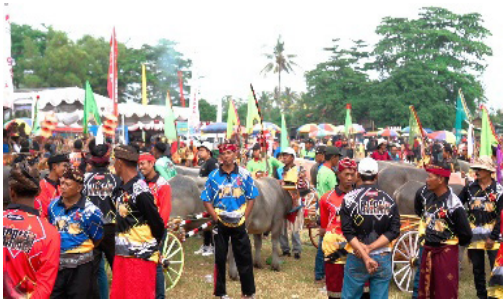
Figure 12. Sequence Four visually

The primary motivation of this sequence is to highlight the development and changes in social, economic, and tourism aspects related to the Mekepong tradition in Jembrana. Footage of festivals, related events, and everyday scenes featuring Mekepong activities aim to enhance the audience's understanding of the social and economic impact of this tradition on the local community. Additionally, it aims to showcase the popularity and significance of Mekepong in Jembrana's culture.