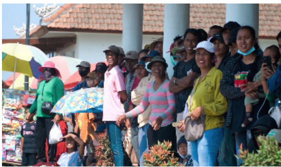
Figure 11. Sequence Three visually

The primary motivation is to showcase the beauty and joy within the Mekepong tradition while highlighting the spirit of the Jembrana community in preserving their cultural heritage. Dynamic movements, traditional costumes, and captivating camera angles aim to capture the essence of joy, competitive spirit, and cultural richness of Bali. Information conveyed through this sequence includes details about the Mekepong tradition, such as the participation of the Jembrana community in the races, their dedication to the event, buffalo selection, the origin of the tradition, the execution of Mekepong, and the values embedded within the tradition.