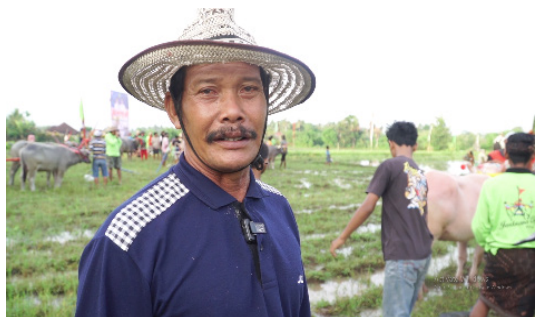
Figure 6. Buffalo Owner

In image 4, 5, and 6, photographs of interviewees are presented, who were interviewed on-site, representing key information sought after. These interviewees include the Mekepong coordinator, providing insights into the execution of this tradition and detailed explanations thereof, the buffalo owners who actively participate as practitioners of this tradition, and the young buffalo jockeys conveying messages regarding the continuity of this tradition.