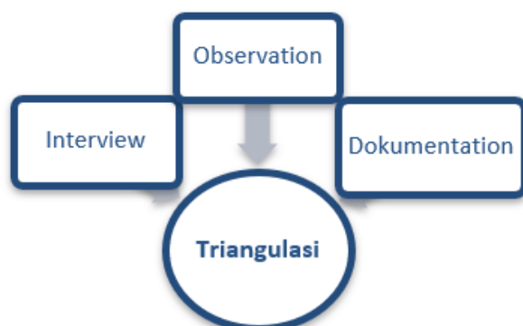
Chart 1. Data Triangulation techniques