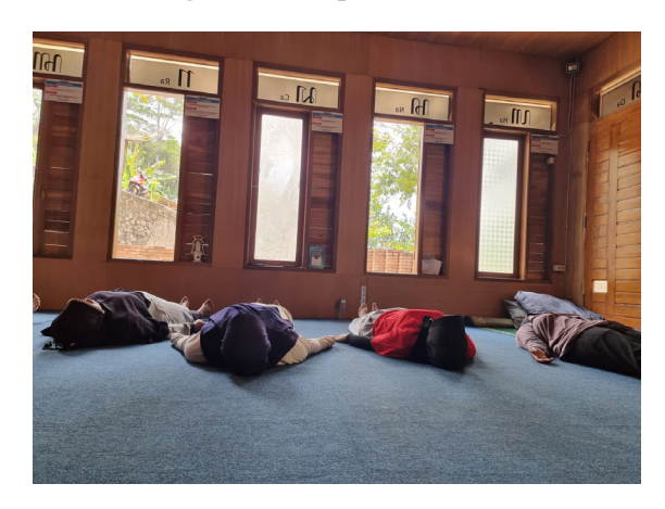
Figure 4. Participants in annexation

control emotions and depression; It can also improve interpersonal relationships with others, because with comfortable situations attract people to be comfortable being close to us and thinking more rationally. (Nurnaningsih, 2020, p. 21)