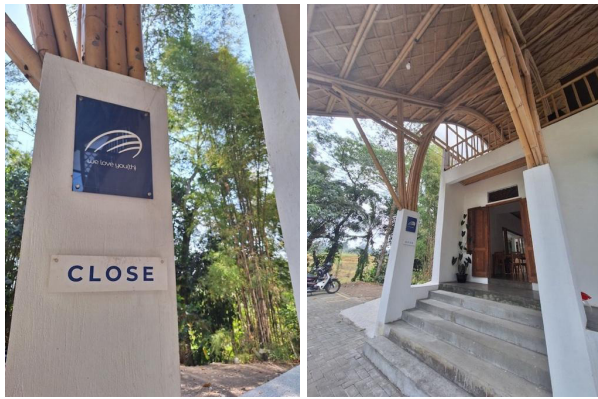
Figure 3. (a) A staircase leading to the main entrance with We Love You(th) signage on the main pillar. (b) We Love You(th) signage as the main information to guide the main building.

in activities in the bamboo-domed hall above, which is reached by turning right to locate the staircase, which is also a prominent feature. Upon entering the spacious, unpartitioned bamboo dome hall, which contrasts with the plain cement floor, users are prompted by action vectors to move in different directions. Here is another prominent attribute of utility: the bamboo woven screen and fibre cover on the second part of the dome arch, which serves to shield from direct sunlight and repel rain.