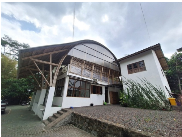
Figure 1. The architecture of Kampung Halaman Foundation in Yogyakarta is characterized by dome-roofed buildings known as We Love You(th), henceforth abbreviated to WLY.