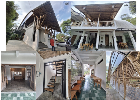
Figure 4. (a) Front view of the WLY building from the oblique side; (b) Back view of the WLY building; (c) West entrance door to the WLY café area; (d) Staircase leading to the bamboo dome hall; (e) Café terrace next to the west door; (f) Curve of the bamboo dome hall with woven bamboo and fibre walls to shield against rain and sunlight.