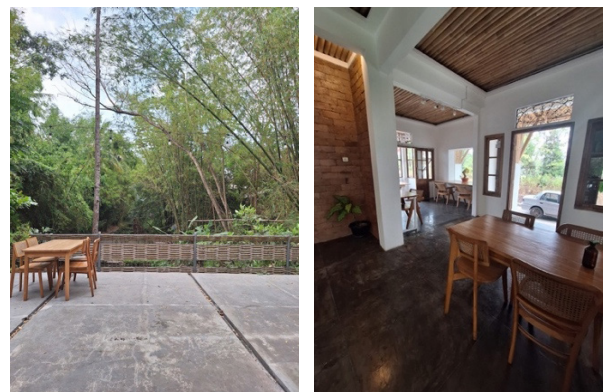
Figure 7. (a) WLY's backyard cafe terrace adjacent to the pond and bamboo forest; and (b) The arrangement of the cafe interior as the main information value dimension of the pond and bamboo garden;