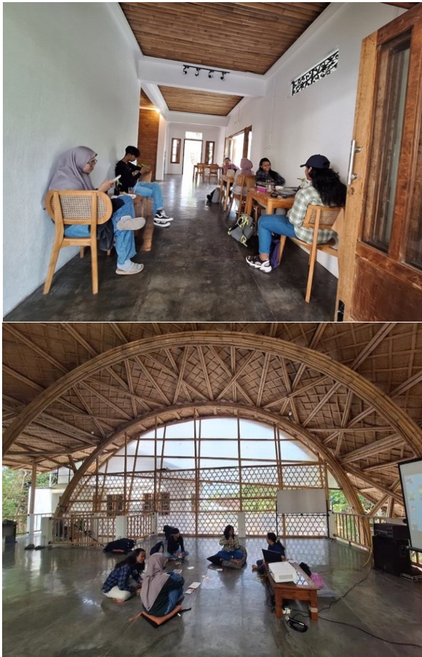
Figure 5. (a) The interaction between visitors in the café; and (b) The interaction between people in the bamboo dome hall