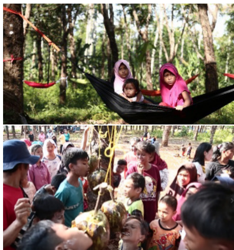
Fig. 3. The Play Ground of Children

In the implementation stage: Informing, the adventure tourism in the use of the land rubber and passive first determined cleared. Locations accurate determined by measuring the land for broad a camping ground. The Sumanding areas and the foundation in the top permit, need to use better than village and plantation PTPN (Factory Plantation of Indonesian Nation) because land at the top company-owned a rubber plantation, ciniti and foundations. Permission made to educate that which is done villagers in tourism development is of land use without disturbing trees and rubber exercised by production company.