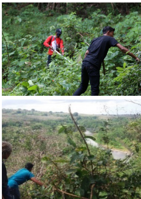
Fig. 2. Clean The Environment

Desa Sagara them by name and character likes the ocean. Sagara means seas or the broad, so village leaders it is somebody sagara energinya the large, behavior wonderful as white sand ( pasir putih ), that in as the 'sagara' (ocean) and loving. This character village leader it is hoped that Sagara as a model rural development and residents environmentally sound welfare.