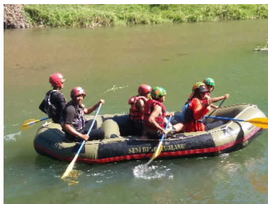
Fig. 1. The ORAT Test in Cibalong River

The active participation of community sagara that the village in this program, 1) is a great desire the village head and community to improve their economy through community empowerment above average, and 2) the potential and environment very rich and diverse not empowered as a source of additional economic in the tourist village. That is in line with people hope on the head