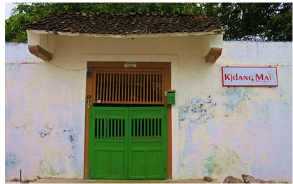
Fig. 1. The Kidang Mas Peranakan House