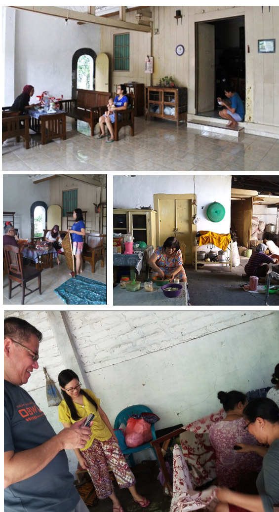
Fig. 2. various traditional-socio-cultural activities in Kidang Mas Peranakan House

However, repositioning does not erase memories and experiences about the house, a sense of attachment remains in every occupant of the house because the roots of tradition and culture are not uprooted, not removed, just simplified.