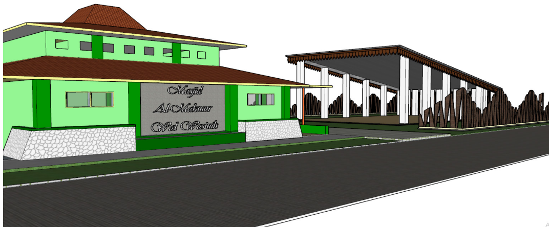
Fig. 2. The existence of art space as part of mosque

nomenon where people believe that certain places have a “spirit / soul” that inhabits the place. It is the spirit / soul that reflects the uniqueness of the place, thus making it distinctive from other places. The spirit / soul that gives meaning to a place, keeps it, and inspires it with feelings. Without the presence of a spirit of place in a place, a place will have no meaning, so it will not have a personal impression, but only general [10].