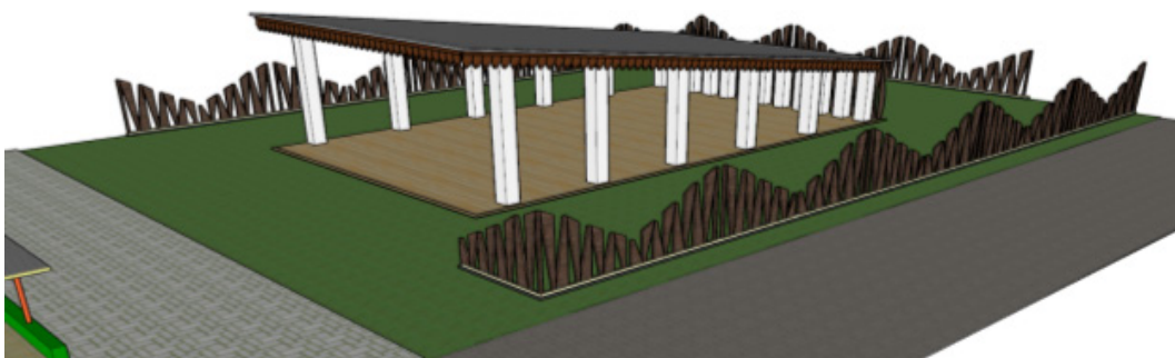
Fig. 3. Tagog anjing roof model to articulated Sunda traditional architecture

Sumur Batu art sacred space is the main idea of design theme, with the water-well as the main focus and an integral part of the design, semi-outdoor buildings are designed, to emphasize that; an ‘art space’ building is not a permanent building, outdoor art space, only a protective building for