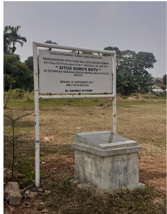
Fig. 1. SK Walikota penetapan Sumur Batu sebagai Benda Bersejarah

Therefore, the proposal to make Sumur Batu one of the national gallery satellites was put forward, with the main objective of providing an alternative venue for exhibitions and art perfor-